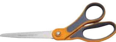
299881 GENERAL PURPOSE 21cm