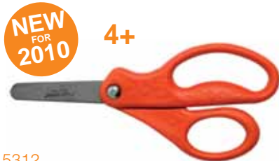
5312 KIDS RECYCLED 13cm