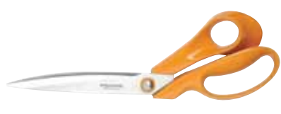
9843O33 TAILOR SHEARS 27cm