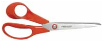
9950R33 GENERAL PURPOSE - Left Handed 21cm