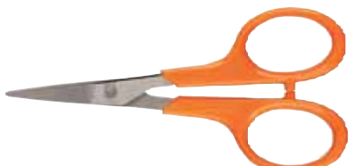
9807O33 EMBROIDERY Micro-tip® 10cm