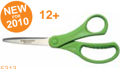
5313 STUDENTS RECYCLED 18cm