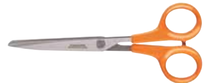
9859033 MULTI PURPOSE 17cm