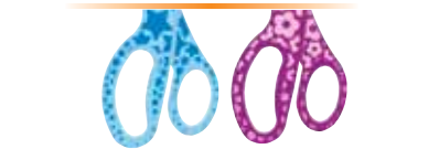
4169 KIDS SCISSORS 13cm