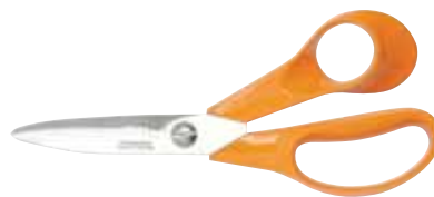
9874O33 KITCHEN AND FOOD 17cm