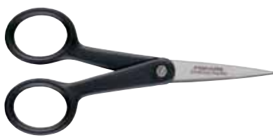
9981B33 SEWING 13cm