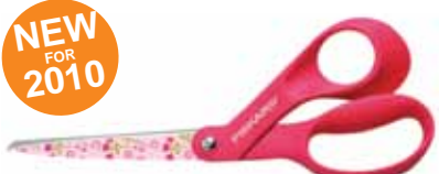
4155x GENERAL PURPOSE - Bouquet 21cm