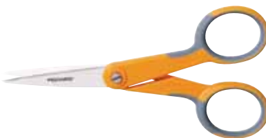
299888 Micro-tip® 13cm