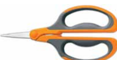
9476 Micro-tip® BIG LOOPS 18cm