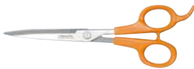
9487O33 HAIRDRESSING 17cm