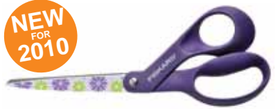
4154x GENERAL PURPOSE - Vineyard 21cm

■ We have taken our scissors to a new level-colour-wise. Oozing with the same quality, ergonomics and performance as our core scissor range, these printed blade scissors are simply gorgeous.