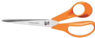
9853O33 GENERAL PURPOSE 21cm