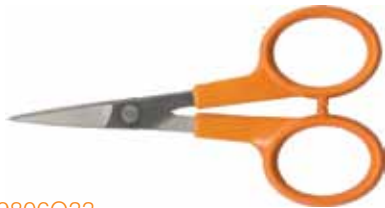
9806O33 MANICURE STRAIGHT 10cm