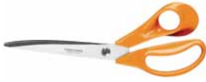
9863O33 DRESSMAKING 25cm