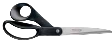
9961B33 DRESSMAKING 25cm