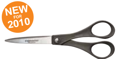
209101x RECYCLED UNIVERSAL SCISSORS 18cm