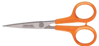
9881O33 NEEDLEWORK Micro-tip® 13cm