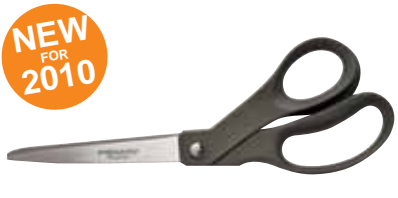
209102x RECYCLED UNIVERSAL SCISSORS 21cm