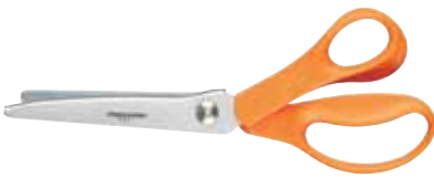
9445O33 PINKING SHEARS 23cm