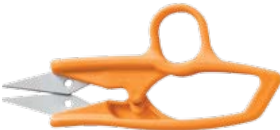
9495O33 QUICK CLIP