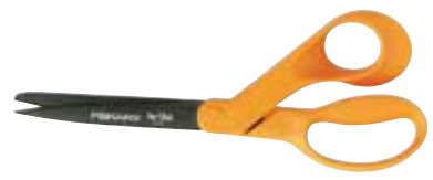
299997 GENERAL PURPOSE Non-Stick™ 21cm