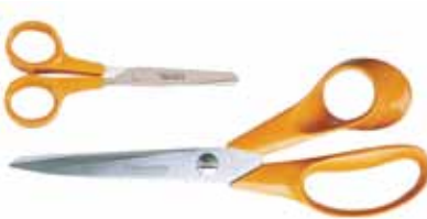
985391O33 TWIN SET HOBBY